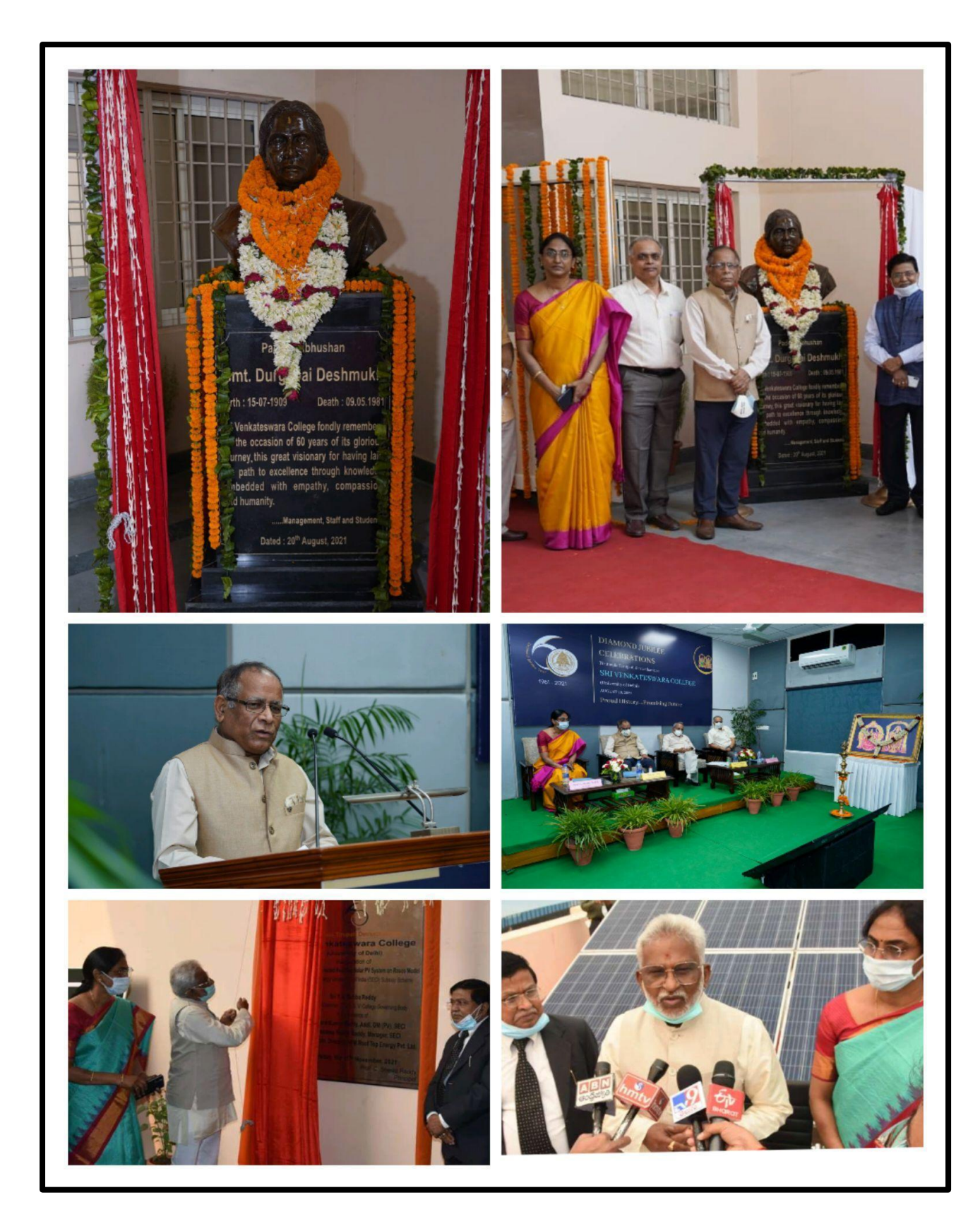
DIAMOND JUBILEE CELEBRATIONS AND SOLAR PANEL INAUGURATION